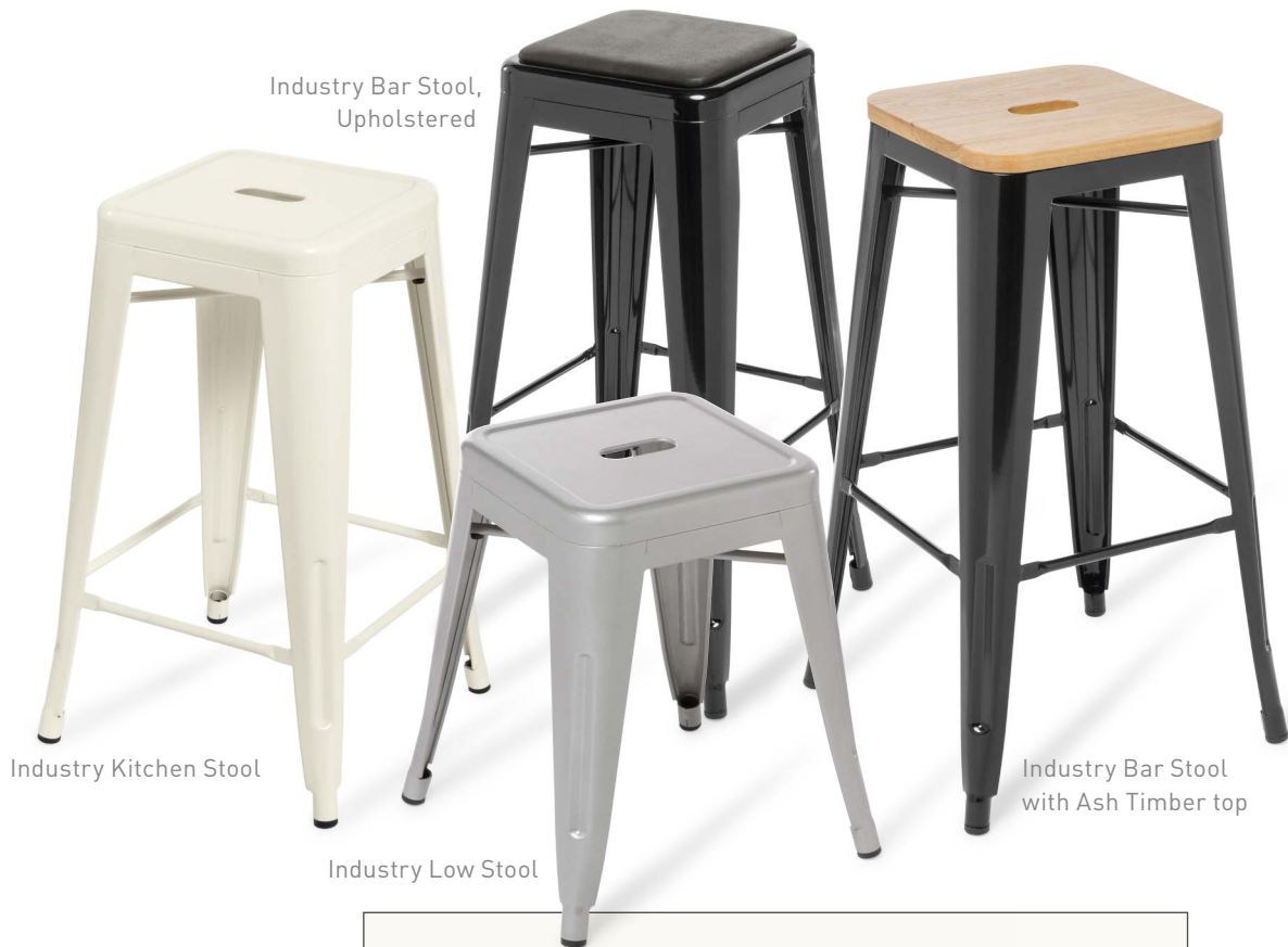
Industry Bar Stool, Upholstered